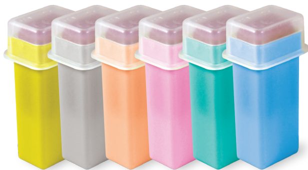
The Original SurgiLance™ safety lancets

Our customers consistently compliment us on the quality of our SurgiLance™ safety lancet. I am very pleased to report that we continue to meet our target of less than one complaint per three million safety lancets sold.