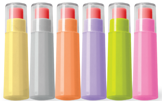
The New SurgiLance Lite™ line