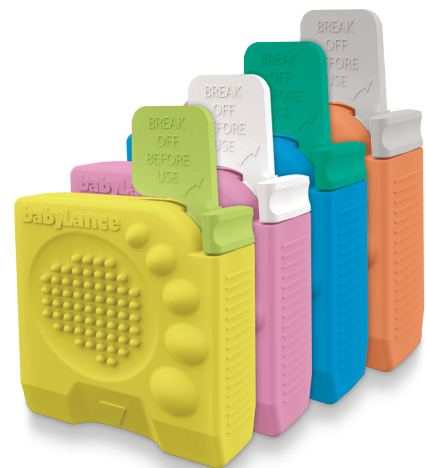
babyLance™ safety heelsticks

Since Clinical Innovations acquired babyLance™ on 27 July 2016, sales of babyLance™ has grown significantly and the product is now available in more countries.