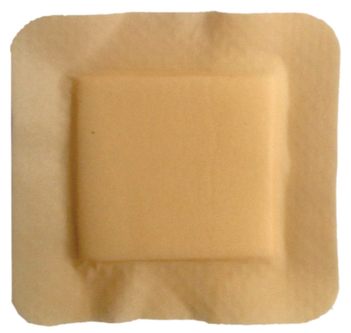
An example of an advanced wound care dressing

Several new distributors in the US and Latin America will be selling these products in their territories in 2019.