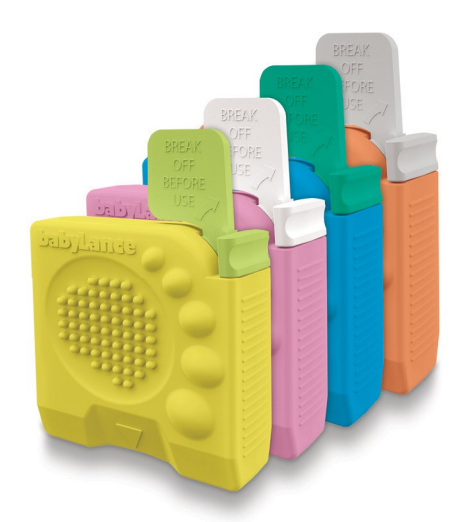
babyLance<sup>™</sup> safety heelsticks

Clinical Innovations' sales of babyLance ^{\text{TM}} continue to grow according to our projections.