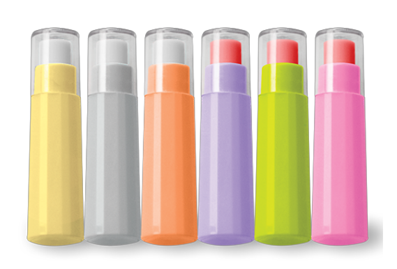
The New SurgiLance Lite™ line