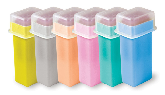
The Original SurgiLance<sup>™</sup> safety

Our customers consistently compliment us on the quality of our SurgiLance<sup>TM</sup> safety lancet. I am very pleased to report that we continue to meet our target of less than one complaint per three million safety lancets sold.